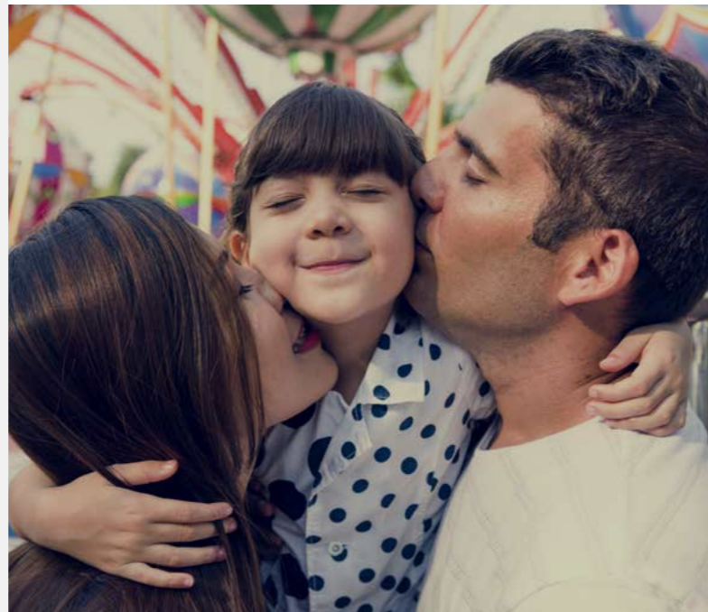
JOURNEY TWO Play.