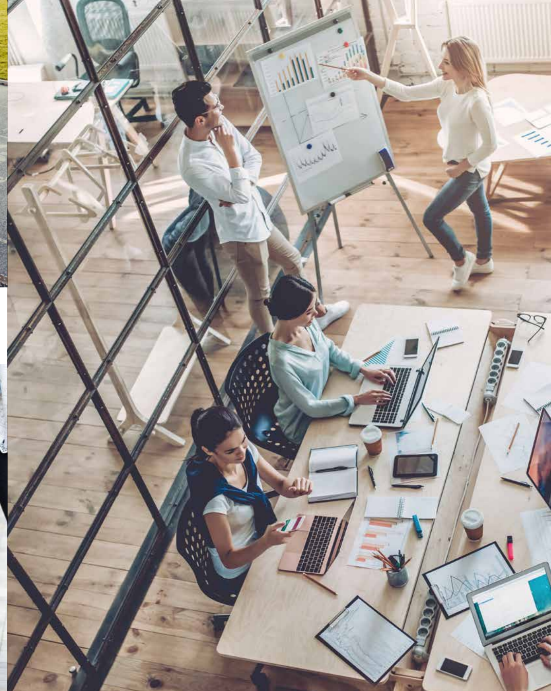
JOURNEY FIVE Work.