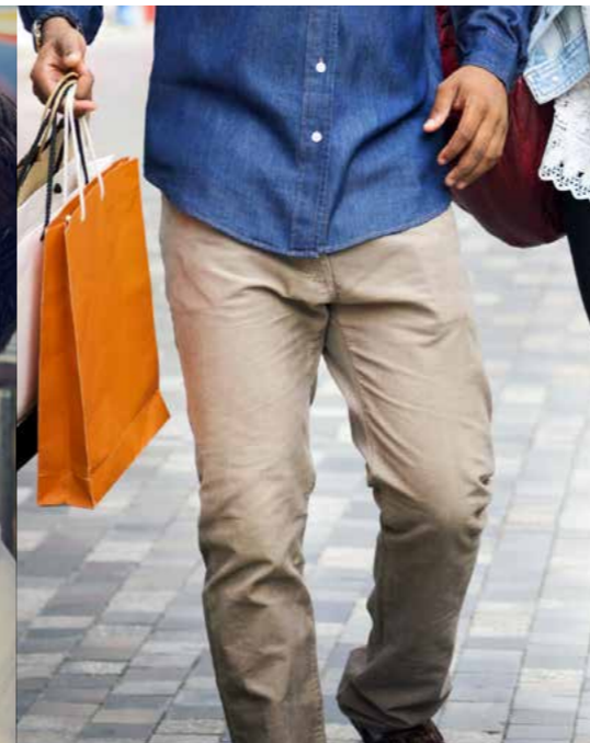
JOURNEY FOUR Shop.