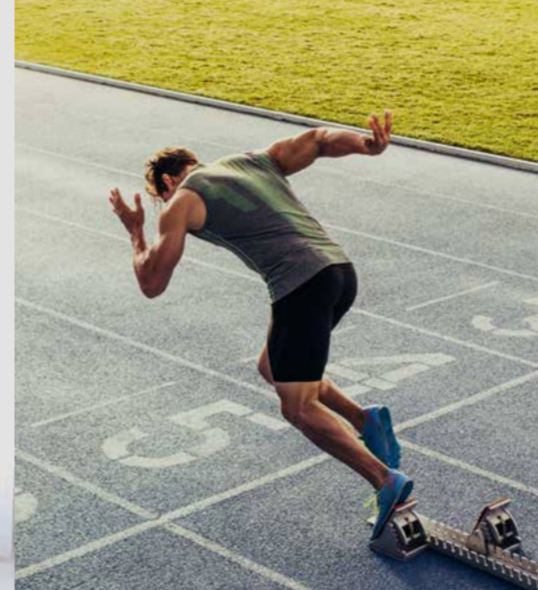
JOURNEY THREE Grow.